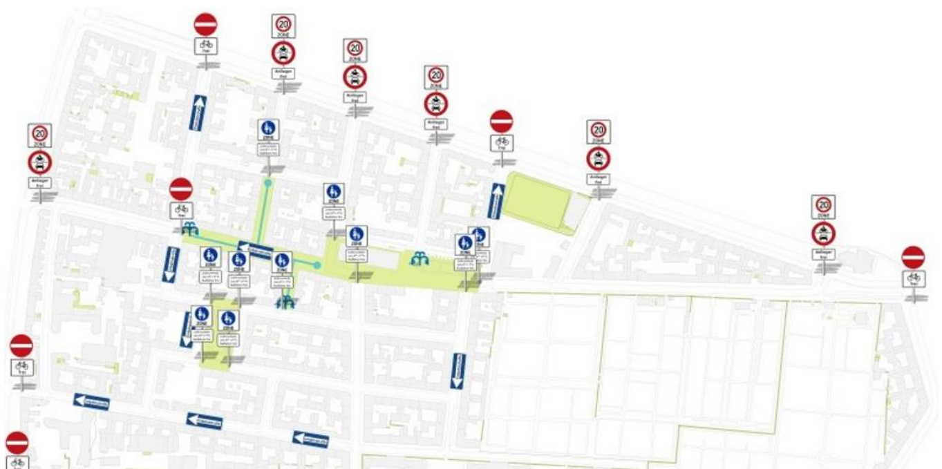
Figure 2: Plan for Bergmannkiez after final traffic calming.

For the design of the planned pedestrian zone in Bergmannstrasse, the District Office announced an urban planning competition (the deadline for applications ran until June 2022). The street is to be made climate-resilient; the planned greenery and water elements (drinking fountains, water features) will lower the temperature of the street through evaporative cooling and shade, thus improving the quality of time spent on the street. 1 In June 2022, additional measures to restructure traffic in the neighbourhood began, but the impact of these measures is not considered further in this report. These include further measures to reduce the through traffic of cars.