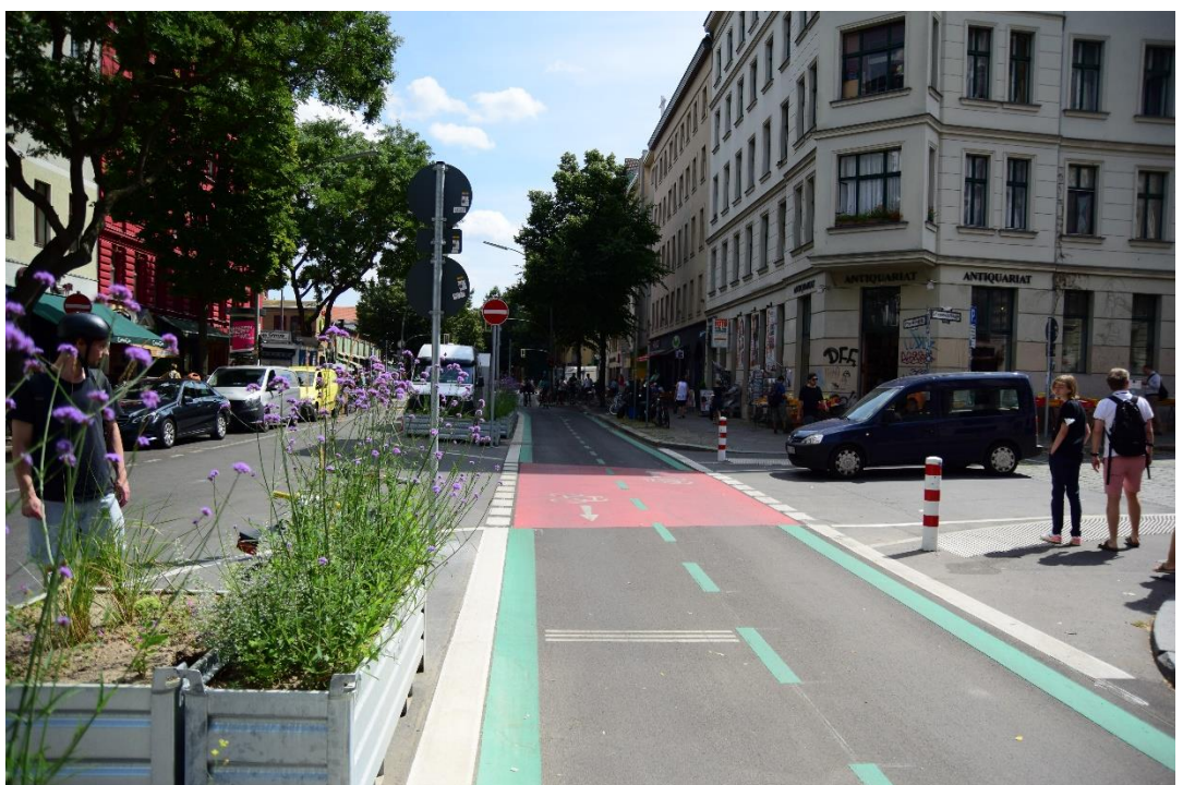
Figure 1: Bergmannstrasse in July 2021

In June, the second phase of traffic calming on Bergmannstrasse, between Nostitzstrasse and Zossener Strasse started with the following measures: A protected two-way cycle lane, installation of green elements, reduction of the speed limit to 10 km/h, one-way street regulation, additional delivery areas and crossing areas for pedestrians (see Figure 2).